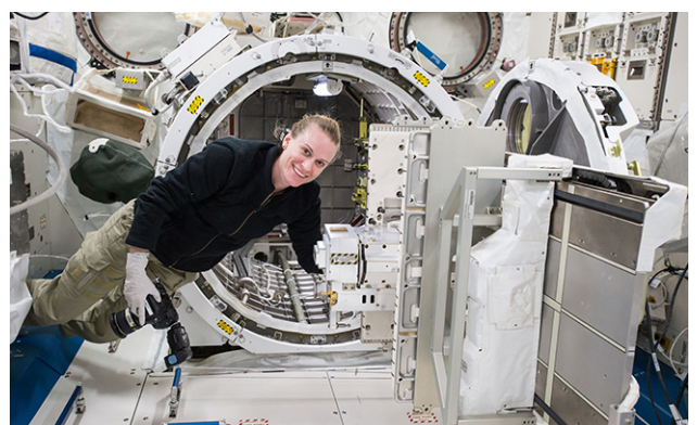
Astronaut Kate Rubins loading the Robotic External Leak Locator for deployment into space.

Over time, there have been intermittent component failures and leaks on the ammonia cooling loop. Astronauts have undertaken spacewalks to help diagnose, troubleshoot and replace components within the complex active thermal control system. Without a way to robotically locate leaks with high accuracy, astronauts have used spacewalk time to inspect and isolate a potential leak site before addressing the problem at hand.