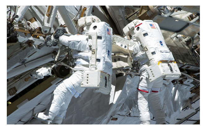
NASA astronauts during a May 2013 leak repair spacewalk.

Just as coolant in your car is used to cool its engine, ammonia is circulated through a huge system of pumps, reservoirs and radiators on the space station to cool all of its complex life support systems, spacecraft equipment and science experiments. This coolant system contains thousands of feet of tubing and hundreds of joints. Throughout its lifetime, this system has experienced tens of thousands of thermal cycles orbiting through night and day and the normal wear and tear that comes with over a decade in service. The space station also has to contend with micrometeoroids: tiny objects whizzing through space at speeds that can easily exceed 20,000 miles per hour — and that can cause unwanted, microscopic holes in spacecraft equipment.